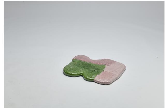
PR2, 50x43x4 cm