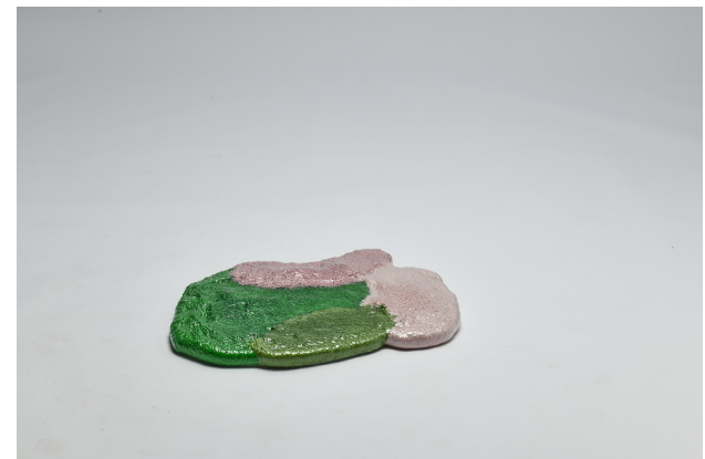
PR3, 60x41x4 cm