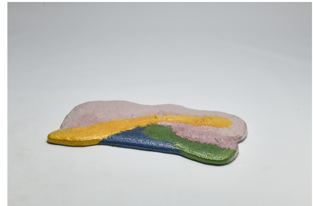
PR1, 90x46x4 cm

The three rugs are a bachelor project made at The Royal Academy at the study program Furniture, space & materials in 2020.